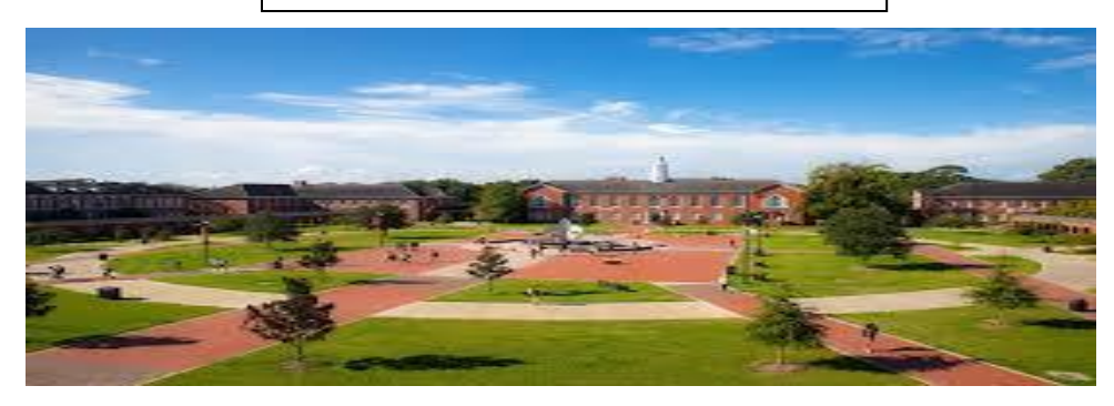
Welcome to the Fall 2019 semester!

UNIVERSITY COLLEGE 104 Declouet Hall (337)482-6829 universitycollege@louisiana.edu